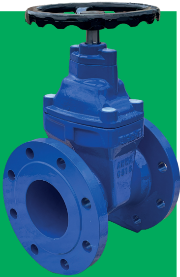
Válvula Compuerta Ext/Brida